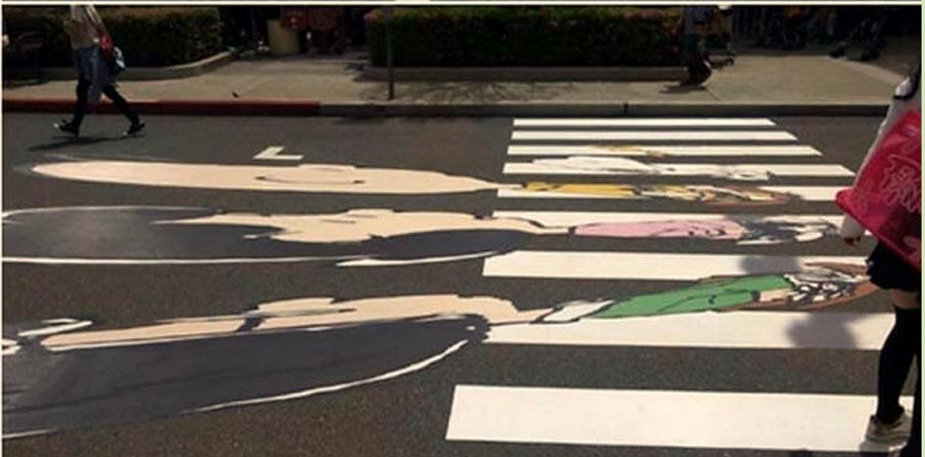
Comic Strip Peanuts Characters Crossing Street