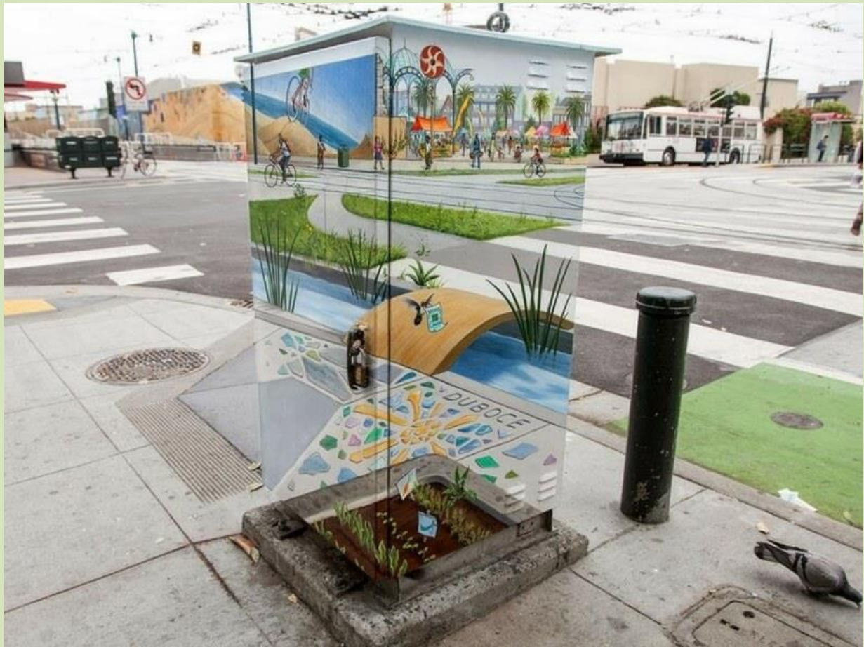
Utility Box Painted by artist to look transparent