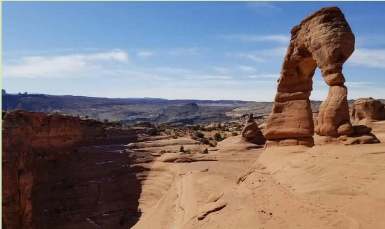
Rock arch that looks twisted – The small base is closer than the large base, but it looks further away because it is smaller.